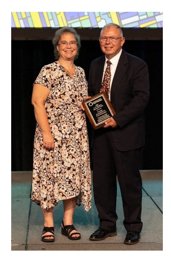
C.B. Shogren Memorial Award

Colombian Association of Food Safety and Technology